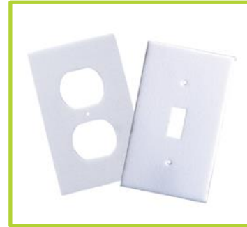
Outlet and switch foam gasket draft sealers