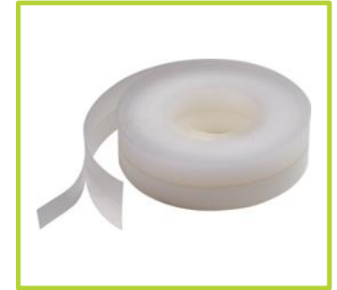
V-seal type weatherstripping