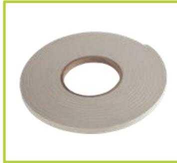
Cell foam tape weatherstripping