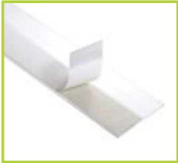
Self-adhesive door sweep